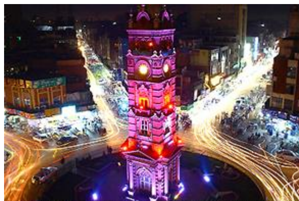
Clock Tower, Faisalabad built by British Government in 19th Century

Pakistan's non-life segment is dominated by three sub-sectors. Property insurance (including household and commercial fire and other risks) accounts for over 40.6% of all activity in 2019 based on Fitch estimation. The catch-all 'other' category accounts for a larger 44.6%. This includes the key basic line of motor insurance as well as another popular line in developing markets - workers' compensation - and health insurance. Transport insurance is a comparatively minor line, making up 14.8% of premiums written.